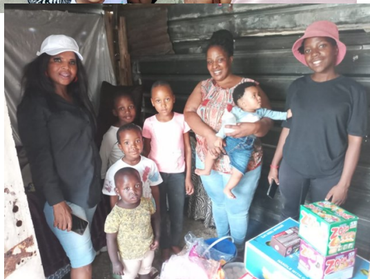
Below—The bigger one is due for Confirmation, and has been with us since he was 2 years old.