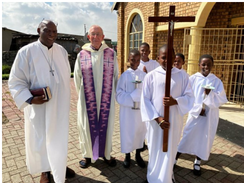
Celebrating the Fifth Sunday of Lent in Embalenhle Township.